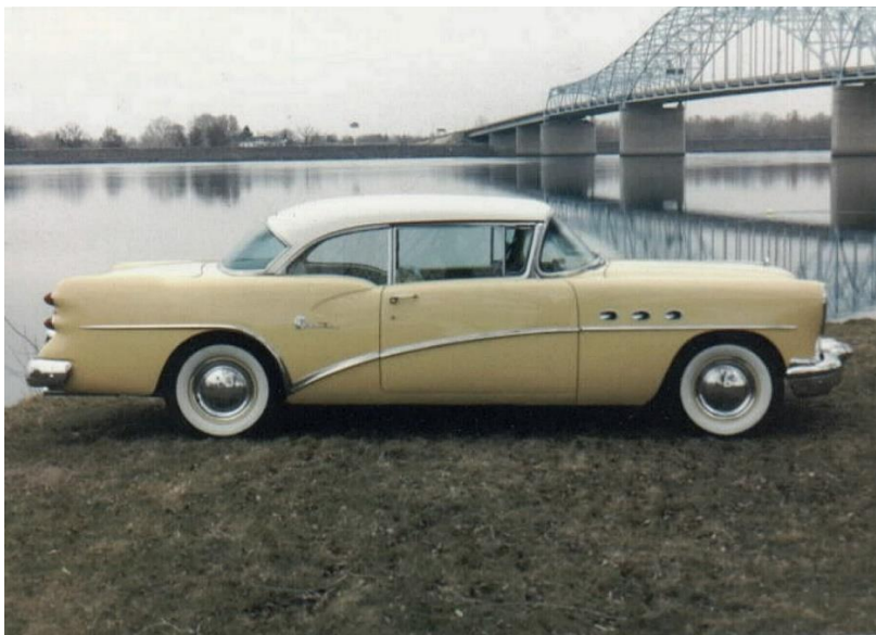
1954 Buick Century Riviera Hardtop