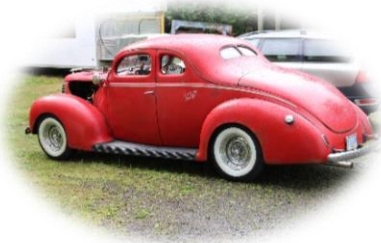
Bloody Mary, beautiful as always!