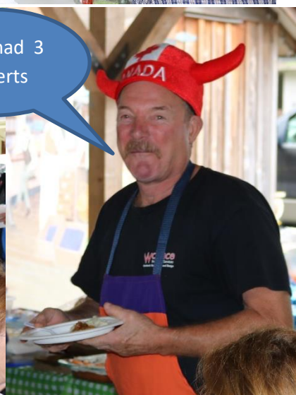
I only had 3 desserts