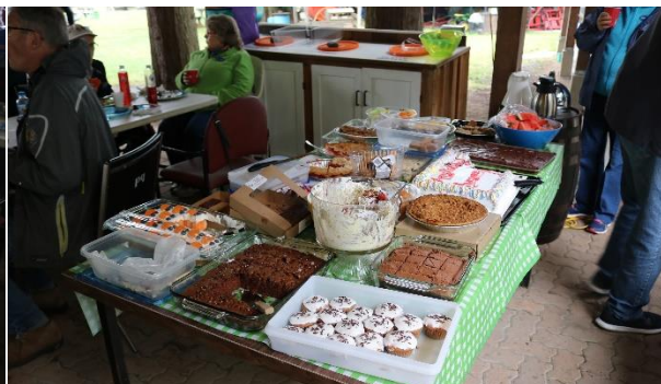
Special thanks to everyone who donated so many excellent desserts and salads!