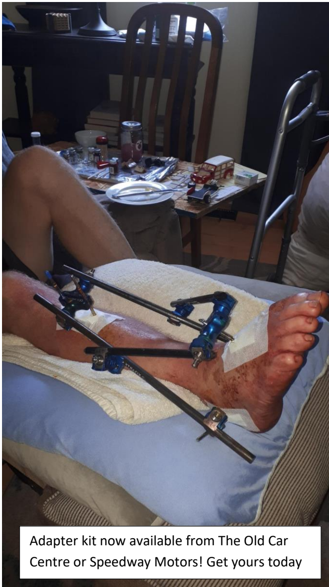
Adapter kit now available from The Old Car Centre or Speedway Motors! Get yours today