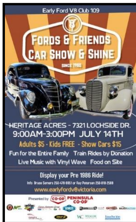
FNF 2019 main poster, by Don Landels